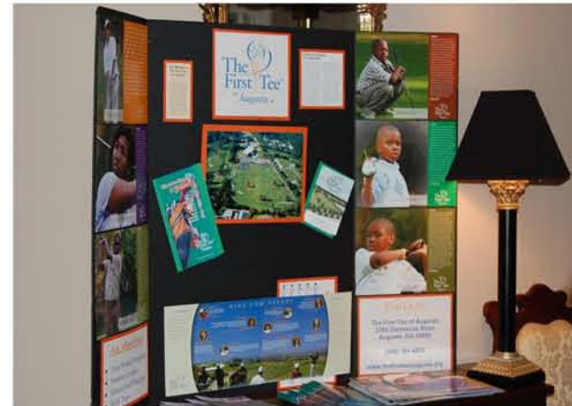
For the 2nd year guest made donation to The First Tee of Augusta