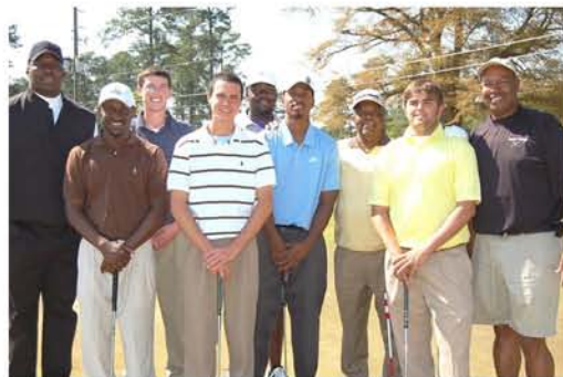
Elder poses with Paine Golf Team and coaches